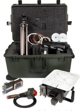
Accessories include a wheeled transit case (standard) and tripod (optional).

For complete certification list see APM-424(V)5 Specification Sheet