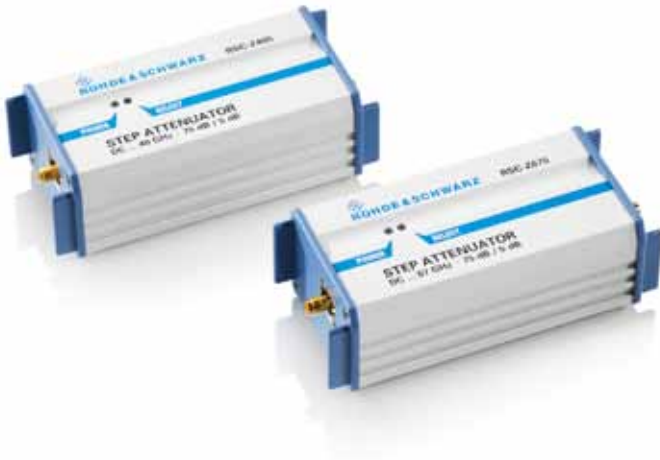
External R&S®RSC step attenuators.

The R&S®RSC has a USB, a LAN and an IEC/IEEE bus interface for remote control on its rear panel, as well as one USB connector for a mouse or keyboard. The R&S®RSC supports the remote control command set used with other Rohde&Schwarz step attenuators, i.e. the R&S®RSG, R&S®RSP and R&S®DPSP, and can even be set to be command-compatible with these devices.