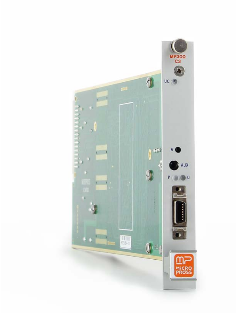
A multiprotocol contact tester