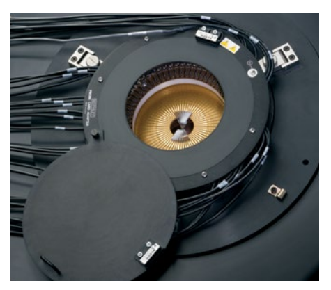
The Model 9139A Probe Card Adapter has been trusted by the industry for more than 10 years. Its combination of low current performance and high voltage capability makes it the ideal companion to the S530 Parametric Test Systems.