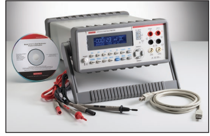
All accessories, such as start-up software, USB cable, power cable, and safety test leads, are included with the Model 2110.

Reference Manual on CD, Specifications, LabVIEW® Driver, Keithley I/O Layer, USB Cable, Power Cable, Safety Test Leads, KI-Tool, and KI-Link Add-in (both Microsoft Word and Excel versions), Calibration Certificate