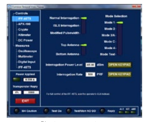
\label{eq:VirtualPanel^m} VirtualPanel^{\rm TM} \ software \ example \ for \ manual \ control \ of \ LRU

Variants (RT-): 1284A, 1284B, 1285A, 1285B, 1286A, 286B,1296A, 1296B, 1557, 1557A,1558, 1558A, 1666, 1666A, 1667, 1667A