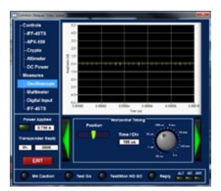
VirtualPanel<sup>™</sup> software example for manual control of scope

VirtualPanel<sup>™</sup> software example for manual control of LRU